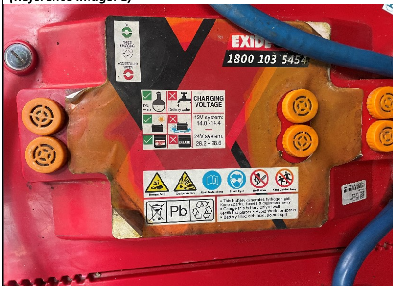
(Reference Image: 1)